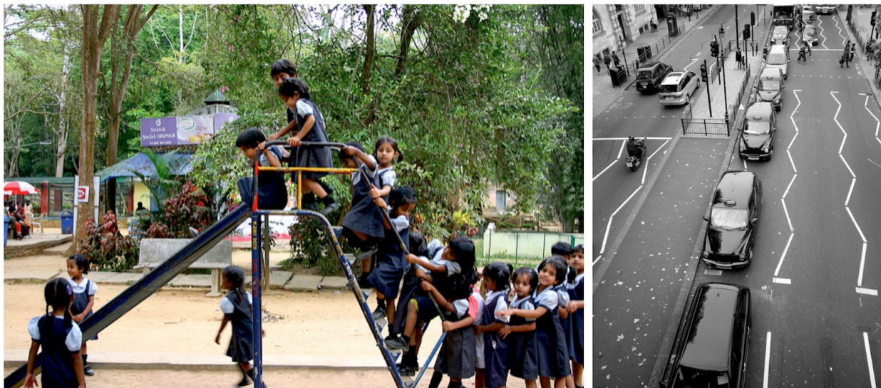
Figure 4. Two examples of a queue of real objects: a queue of children waiting their turn for playing with a slide (left), and a cab wait line (right).

The main characteristic of the elements of this structure is that they follow a first in first out strategy ( FIFO ) for addition and removal. Basically, it means that the first element inserted in the structure is placed in the left-most part of the queue and, thus, it is also the first one that will be removed when requested. Similar to stacks, even in queues it is necessary to remove all the elements that have been added before a certain target element – i.e. from the eldest elements to the most recent ones – to obtain it.