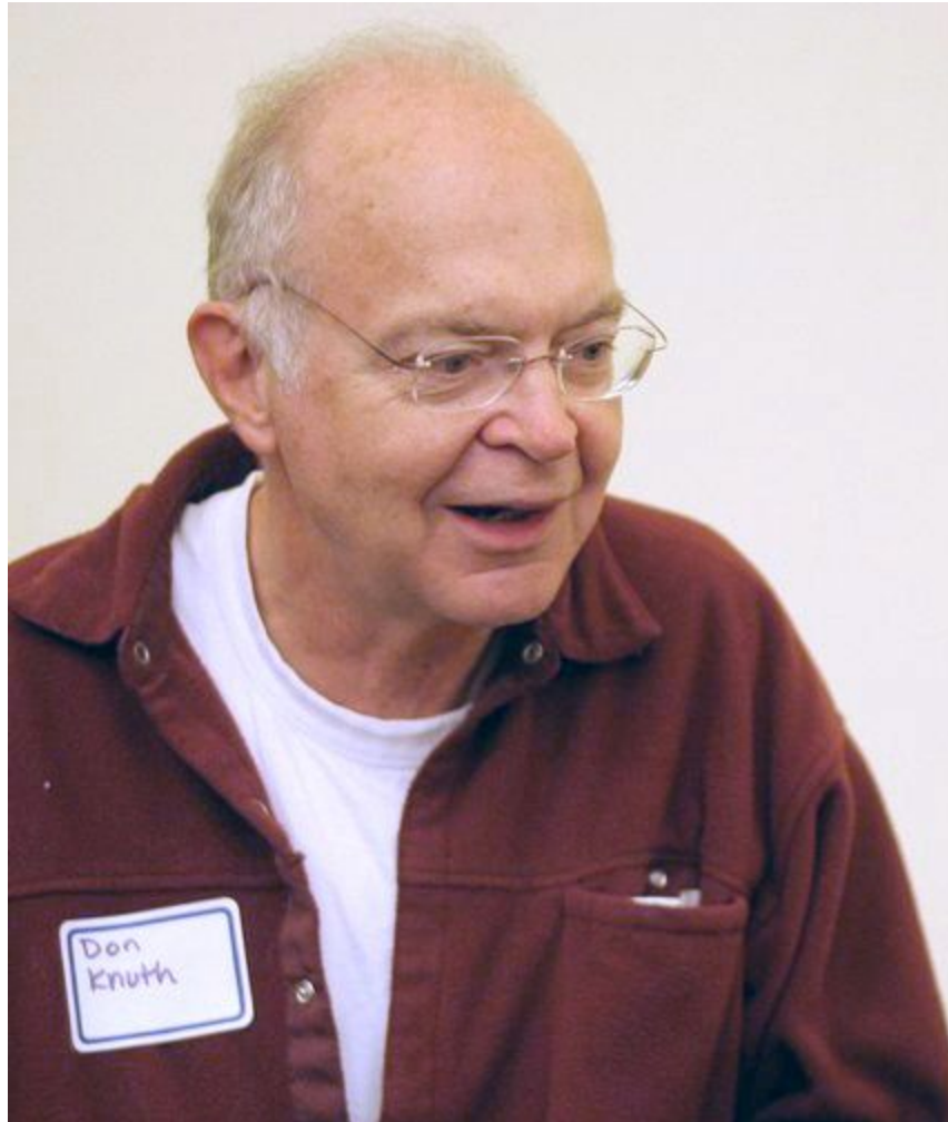
Figure 1. Donald Knuth in 2005.

have been published so far – while the others are still in writing. The first volume is entirely dedicated to the mathematical foundations for allowing a formal analysis of algorithms, and to a comprehensive introduction of all the basic data structures .