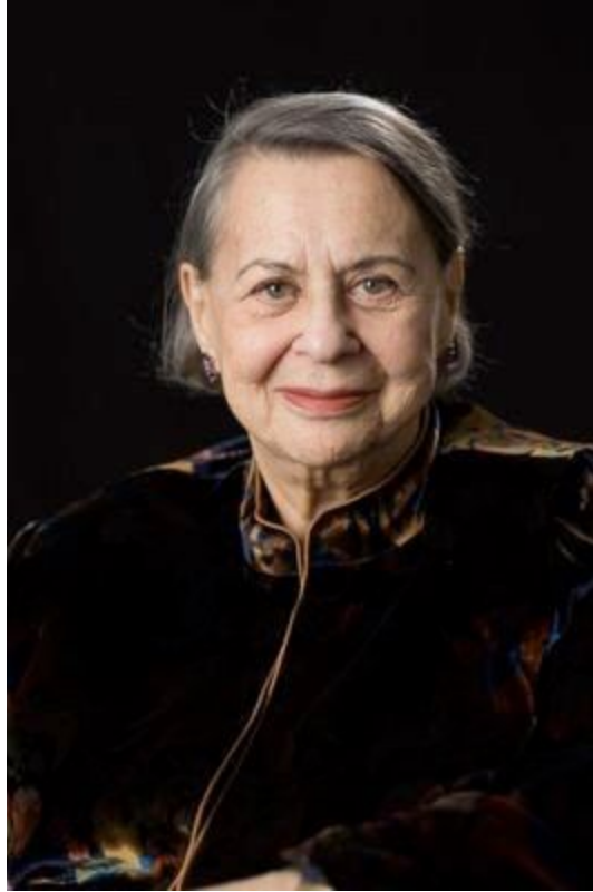
Figure 1. A picture of Evelyn Berezin taken in 2015.