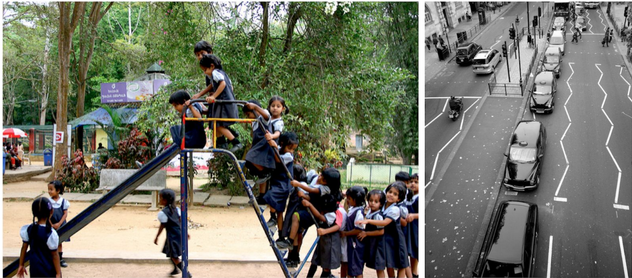
Figure 4. Two examples of a queue of real objects: a queue of children waiting their turn for playing with a slide (left), and a cab wait line (right).

The main characteristic of the items of this structure is that they follow a first in first out strategy ( FIFO ) for addition and removal. It means that we place the first item inserted in the data structure in the left-most part of the queue. Thus, it is also the first one that we can remove when requested. Similar to stacks, even in queues it is necessary to remove all the items added before a specific target item – i.e. from the eldest elements to the most recent ones – to obtain it.