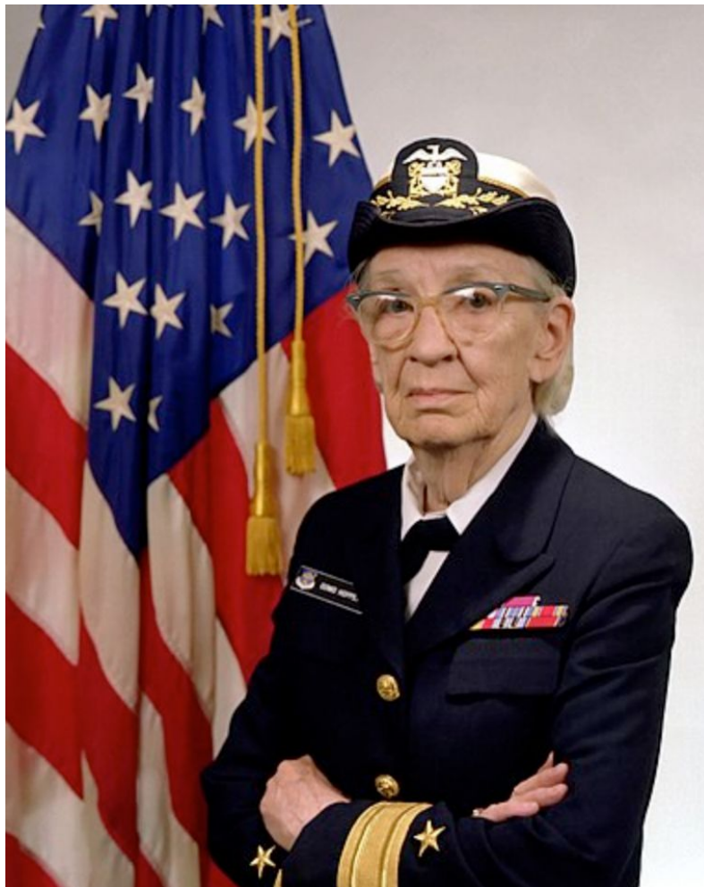
Figure 1. Portrait of Grace Hopper.

COBOL, the same comparison is made with the following instruction: x IS GREATER THAN y .