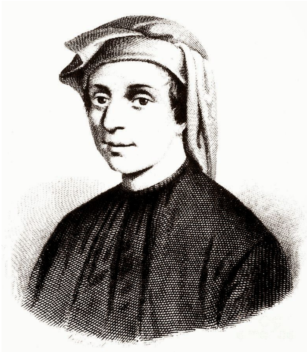
Figure 1. A portrait of Leonardo Pisano, also known as Fibonacci.

between the Fibonacci number at month n-1 and that one at month n-2 , as shown in Formula 1 . As a side note, fib(0) and fib(1) are always equal to 0 and 1, respectively.