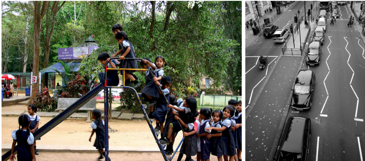
Figure 4. Two examples of a queue of natural objects: a queue of children waiting their turn for playing with a slide (left) and a cab wait line (right).